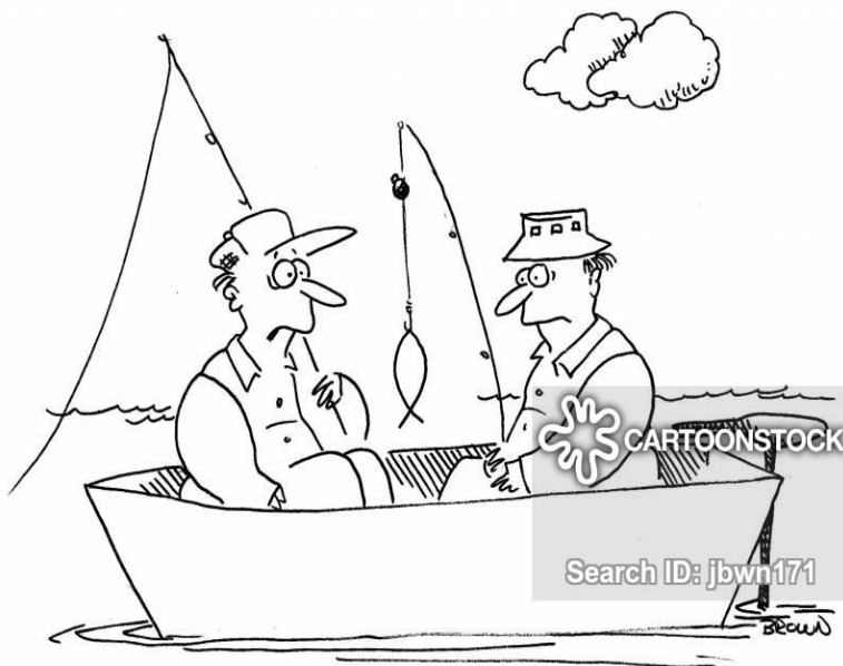
"You might want to let that one go..."